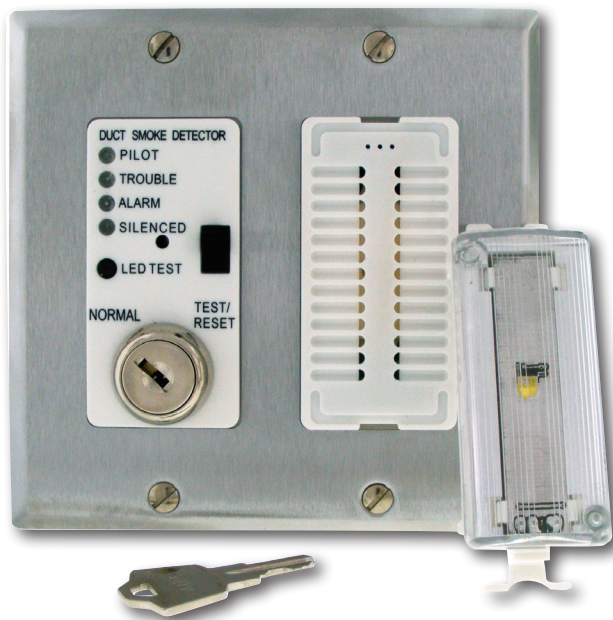
MSR-100RA/S/ with V-Plugin

NOTE: The strobe and audible buzzer features are not ADA compliant, and not intended for life safety notification or evacuation purposes (public mode). These functions are for duct smoke detector status indication only (private mode).